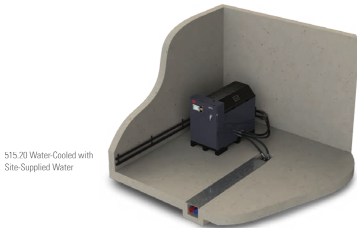
515.20 Water-Cooled with Site-Supplied Water